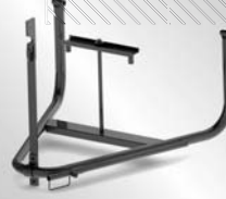
Spare Wheel Carrier