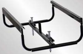
Double Spare Wheel Carrier